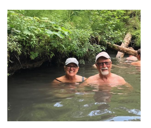
During our 61 day trip via RV, we drove on the Alaska Highway, saw beautiful scenery and soaked in Hot Springs.