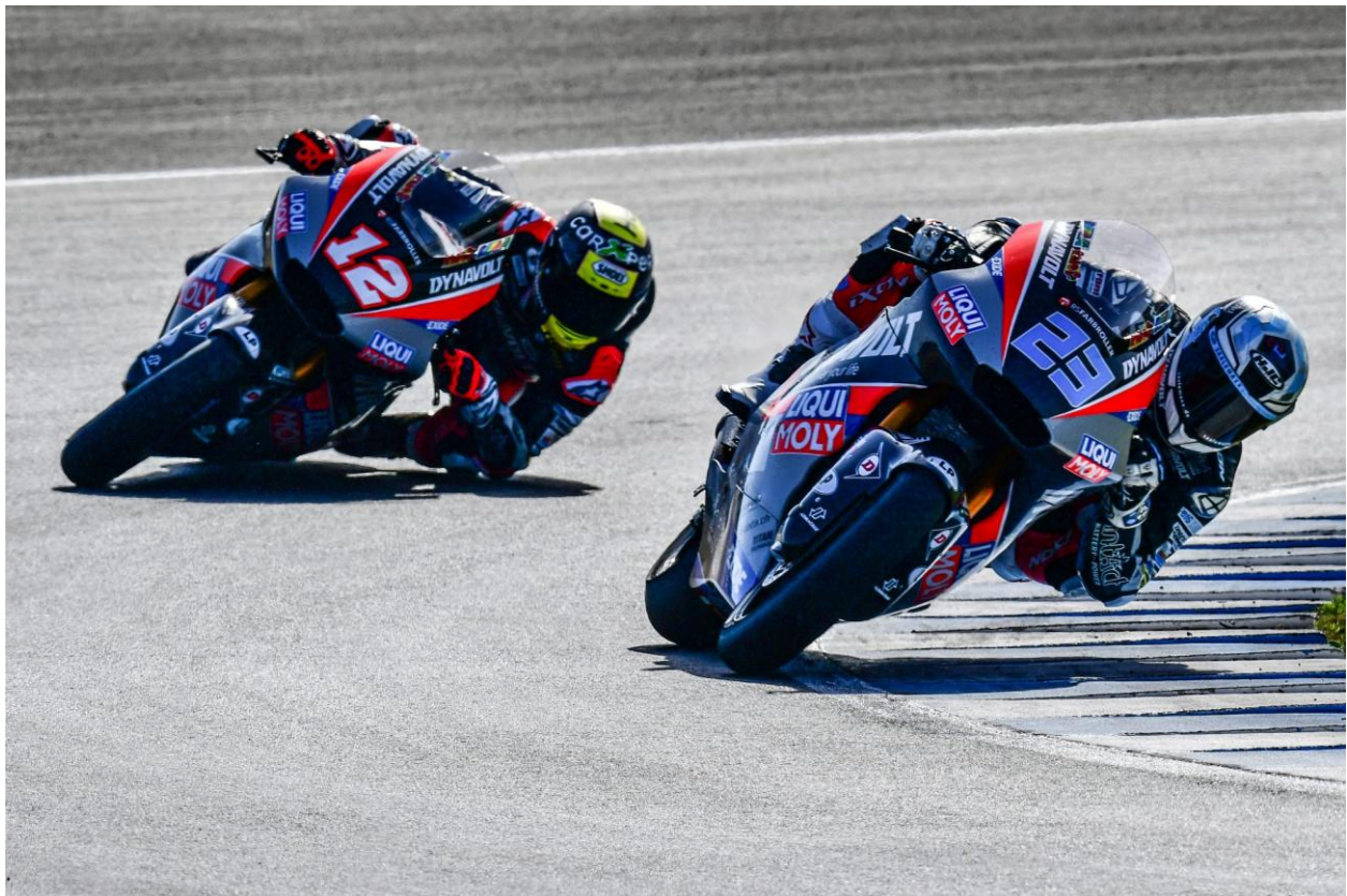
World Superbike Championship in Laguna Seca

I am sharing this from the latest issue of RoadRunner magazine because it is so critical to safe riding. Emergency stops or turns can rattle any rider, but remaining calm can go a long way towards producing a positive outcome. The RR article was about two of the premier racers at the World Superbike Championship in Laguna Seca. The two racers entered a turn with the trail bike slightly behind and to the right of the lead bike. Exiting the turn at speeds of 140 mph the inside rider did not know the other rider was right next to him and he was about to force him off the pavement. Not wanting to panic, the outside rider reached over and tapped the other rider on the back. The insider rider nodded his head and held his line such that the other rider had room to complete the turn. Most of us do not typically ride at 140 mph, but a lot can happen at much slower speeds so keep your head and eyes on a swivel and be prepared for the unexpected.