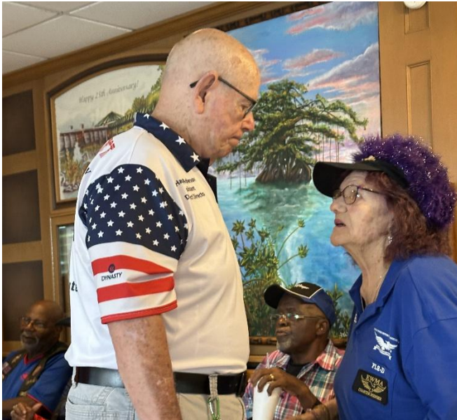
ADD Harry Anderson the Host