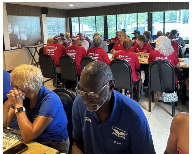
The Red Shirts from Palm Coast