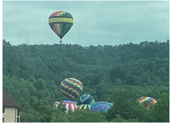
Hot Air Balloon Festival in Helen, GA