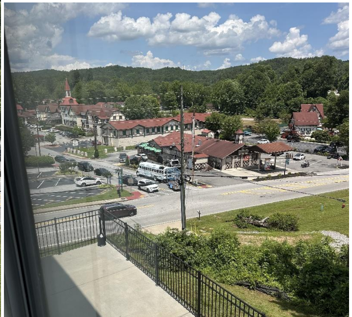
Helen, Georgia – Mountains in background