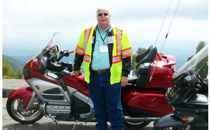
Compares riding BMW Scooter with the Gold Wing