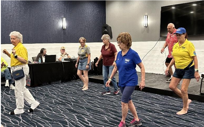
The Rally Dance