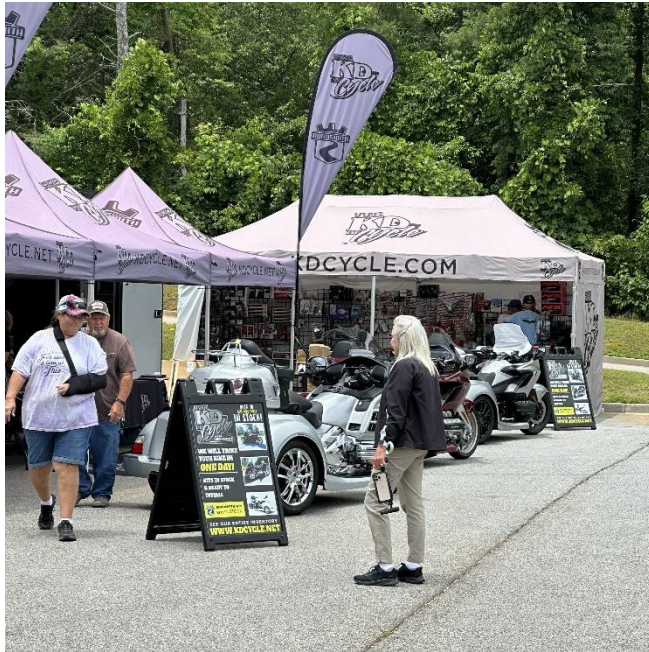
Vendors KD Cycle at Georgia Rally