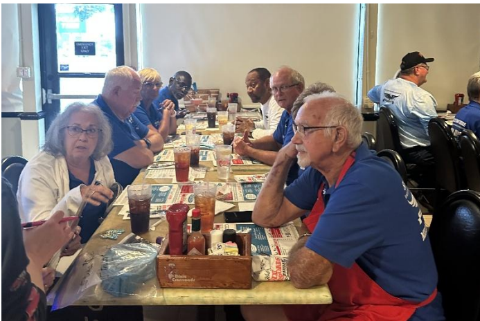
Overview of the 66 in attendance at Dixie Crossroads