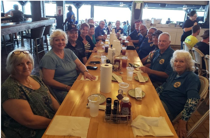
15 at Harpoon Harry's Punta Gorda