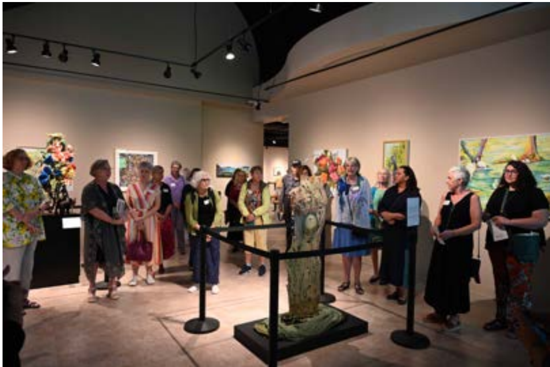
NAWA SC Members gave their Artists' Talks at the Rosen Gallery on May 3.

Please view more Brookgreen exhibit photos on our Facebook page as well as on our website: nawasc.org