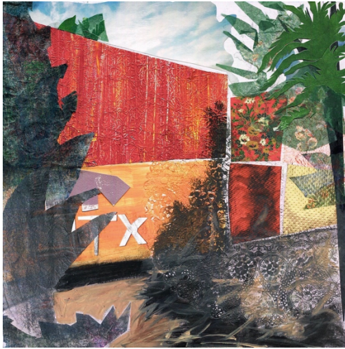
Cascade Locks Train, Mary McDonough

of the moment. Concentrating on the desire for the viewer to see blocks and shapes of color, shadows, and textures in our world, I create a moment in time to pause and consider...that's different! Working with a planned color palette, theme, and collage elements, I use shape, texture, and color to interrupt and pivot a piece in an unexpected direction. Forms are used in modified colors that are opaque or translucent; along with a variety of textures that are painted or printed in acrylic. Wet or dry charcoal sticks, oil sticks and implements are used. Acrylic mediums and varnishes, oil varnish and cold wax are used to finish the piece.