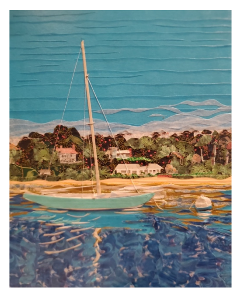
Come Sail Away

Where do you go to reset: Maui. So peaceful. And those waves. We are lucky to go regularly. There is no pressure to make art to sell. It opens up thoughts like a blank canvas.