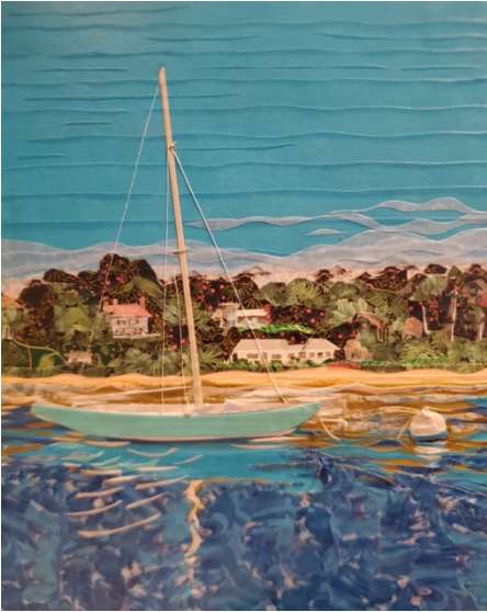
Come Sail Away

Where do you go to reset: Maui. So peaceful. And those waves. We are lucky to go regularly. There is no pressure to make art to sell. It opens up thoughts like a blank canvas.