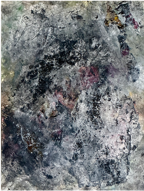
Everything Breaks , by Emi Sisk