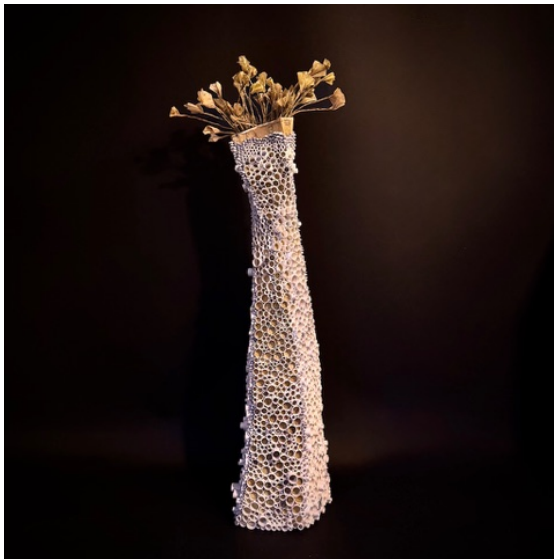
Anemone VI , by Flavia Lovatelli

(left) Mix Media sculpture; recycled pattern paper cord and white card stock rings on a willow and paper mâché