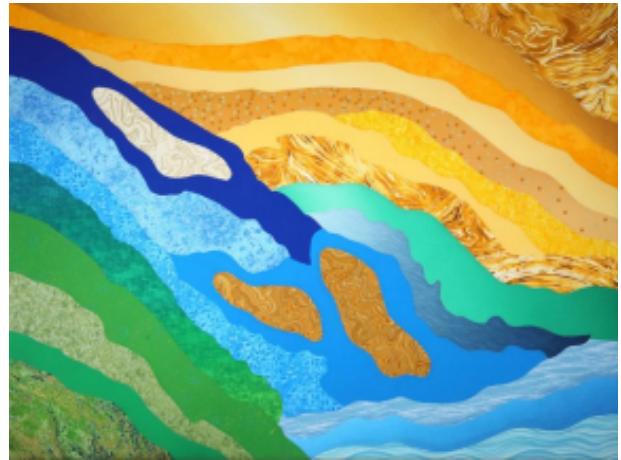
The Quiet Lilt of Tidal Threads , by Selene Paschoal, fabric, 40" x 30"

Selene's artistic approach is mostly intuitive with a constant awareness of color combination and contrast. According to Selene, inspiration for her pieces comes mostly from nature and from her Brazilian heritage and culture. The colors she chooses are usually bold and rich capturing the natural beauty of the country as well as the enthusiasm for life Brazilians are known for.