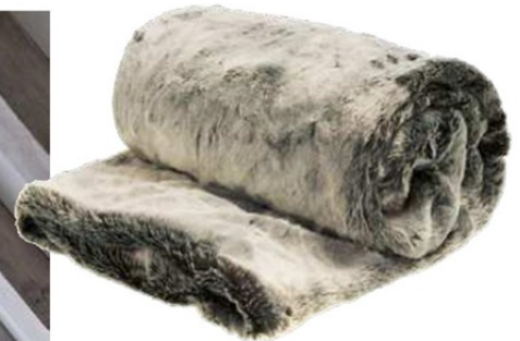
Cosy up against the chill factor in warm, fur-like texture. Faux fur throw , £85, Soak & Sleep