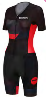
REDUX Trisuit 9C 774L -- REDUX