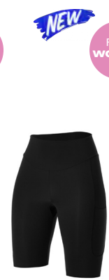
DENI Shorts 9C 68 -- DENI