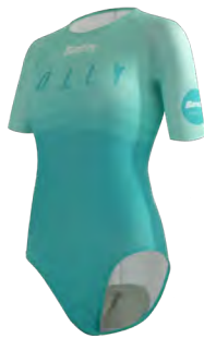
HOLLY S/S Race Suit 9C 1405 -- HOLLY