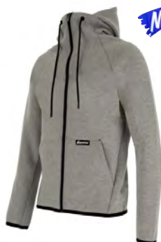
HOODED SP 401 75