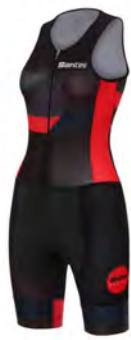
REDUX Trisuit 9C 771 -- REDUX