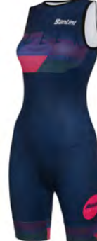
SLEEK Trisuit 9C 776 -- SLK+