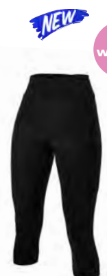
DENI Knickers 9C 134 -- DENI