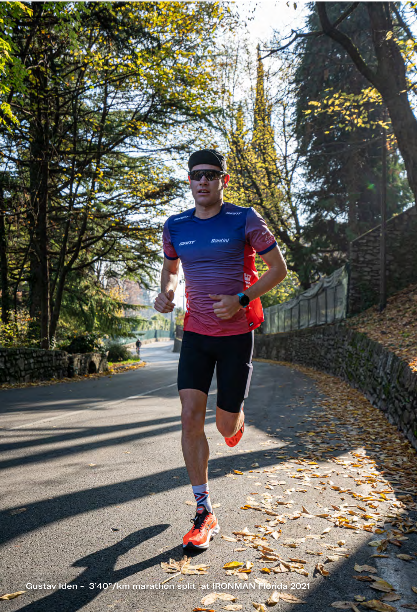
Gustav Iden - 3'40"/km marathon split at IRONMAN Florida 2021