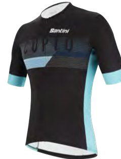
CUPIO S/S Tri Top 9C 63SS 00 CUPIO