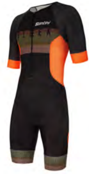
SLEEK Trisuit 9C 777 -- SLK