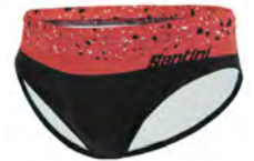
SCUBA Swimming Brief 9C 1401 -- SCUBA