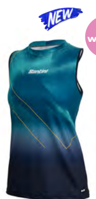
DENI Tank Top 9C 65 GLL DENI