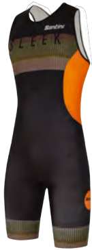
SLEEK Trisuit 9C 775 -- SLK