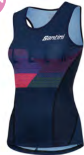
SLEEK Tri Top 9C 65 GLL SLK