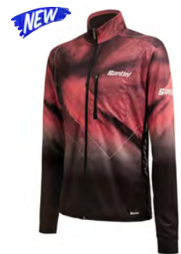
IDEN L/S Jacket 9C 503 75 IDEN