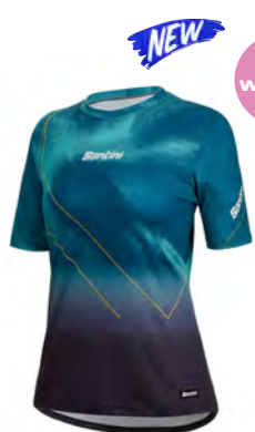
DENI S/S Jersey 9C 498 GLL DENI