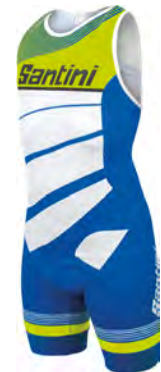
SLEEK Kid Trisuit 9C 773 -- SLK