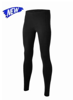
IDEN Tights 9C 1181 -- IDEN