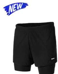
IDEN Double Shorts 9C 21 -- IDEN