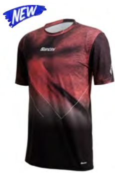
IDEN S/S Jersey 9C 499 GLL IDEN