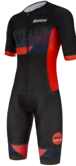
VIPER AERO Trisuit 9C 780 -- VIPER