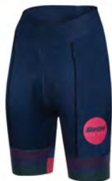
FAST Tri Shorts 9C 68 -- FAST