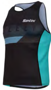
SLEEK Tri Top 9C 63 GLL SLK