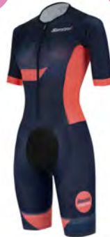
VIPER Aero Trisuit 9C 780L -- VIPER