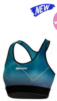
DENI Sport Bra 9C 008 -- DENI