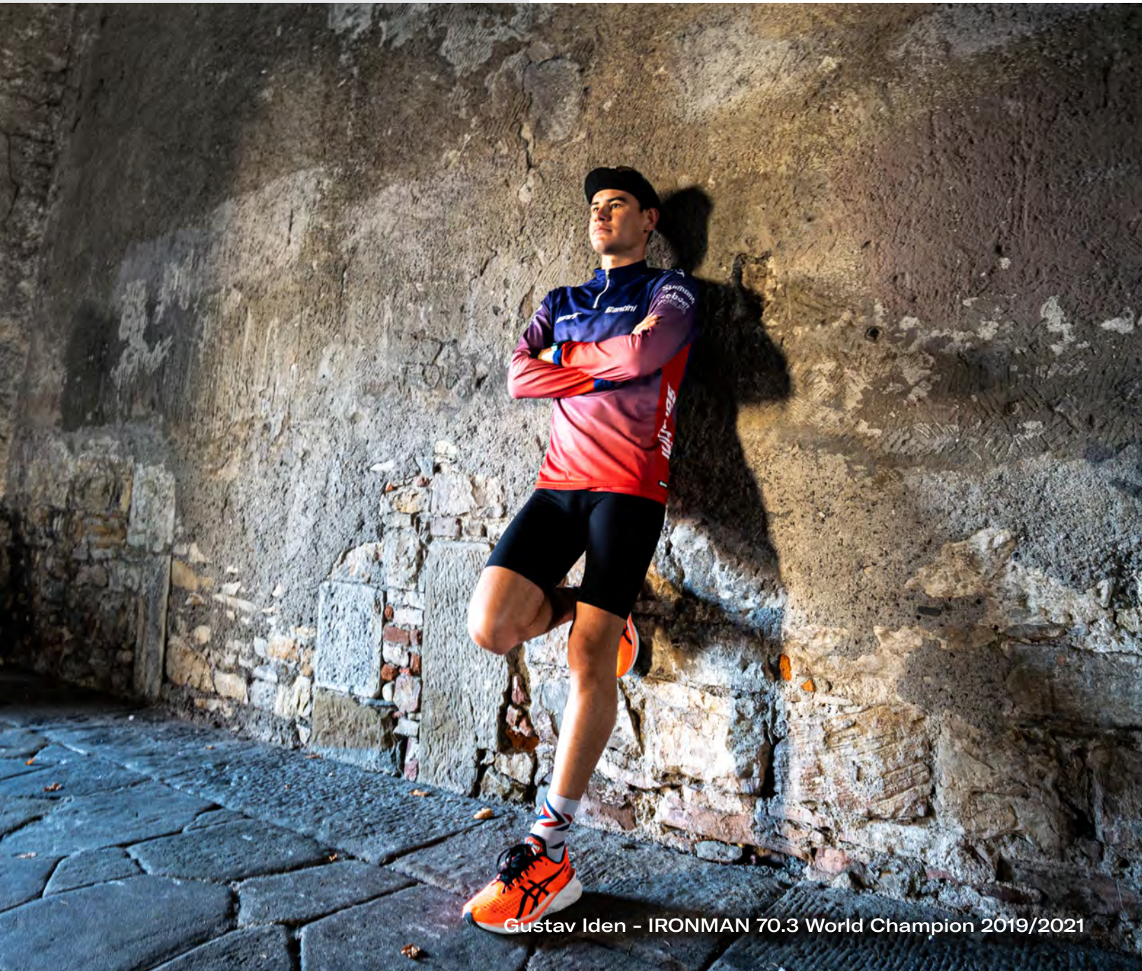
Gustav Iden - IRONMAN 70.3 World Champion 2019/2021