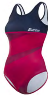
ARIEL Swimsuit 9C 1400 -- ARIEL