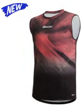
IDEN Tank Top 9C 63 GLL IDEN