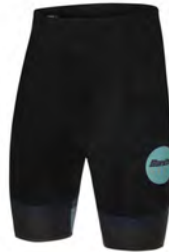
FAST Tri Shorts 9C 70 -- FAST