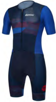
REDUX Trisuit 9C 774 -- REDUX