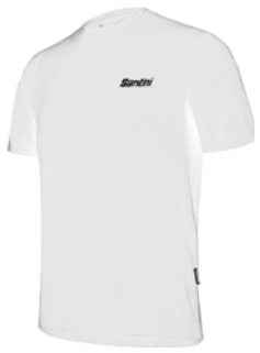
COTTON T-shirt SP 499 COT