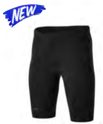
IDEN Shorts 9C 70 --IDEN