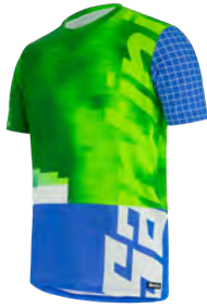
SLAM Jersey 9C 499 GLL SLAM