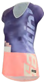
SLAM Jersey 9C 498 GLL SLAM