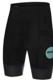
FAST Tri Shorts 9C 70 -- FAST