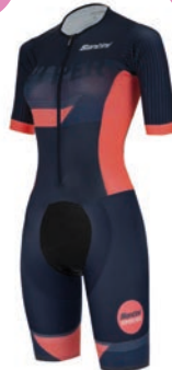
VIPER Aero Trisuit 9C 780L -- VIPER