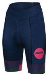
FAST Tri Shorts 9C 68 -- FAST