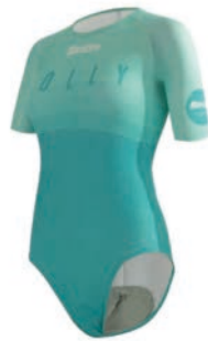
HOLLY S/S Race Suit 9C 1405 -- HOLLY