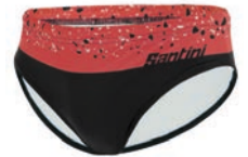
SCUBA Swimming Brief 9C 1401 -- SCUBA