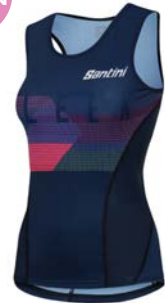
SLEEK Tri Top 9C 65 GLL SLK