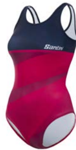
ARIEL Swimsuit 9C 1400 -- ARIEL