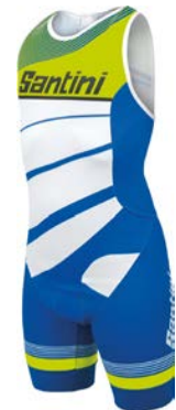
SLEEK Kid Trisuit 9C 773 -- SLK