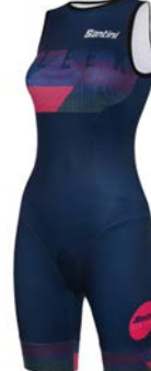
SLEEK Trisuit 9C 776 -- SLK+