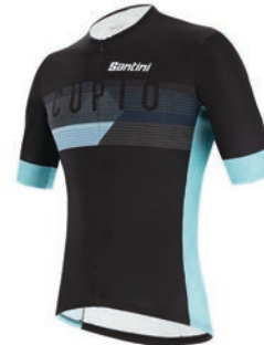
CUPIO S/S Tri Top 9C 63SS 00 CUPIO