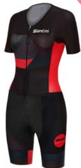
REDUX Trisuit 9C 774L -- REDUX