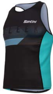
SLEEK Tri Top 9C 63 GLL SLK