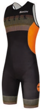
SLEEK Trisuit 9C 775 -- SLK