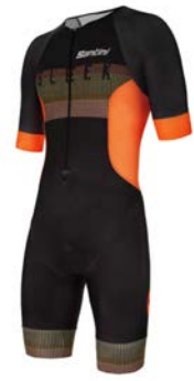
SLEEK Trisuit 9C 777 -- SLK