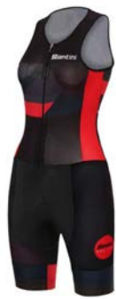
REDUX Trisuit 9C 771 -- REDUX