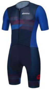
REDUX Trisuit 9C 774 -- REDUX