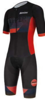
VIPER AERO Trisuit 9C 780 -- VIPER