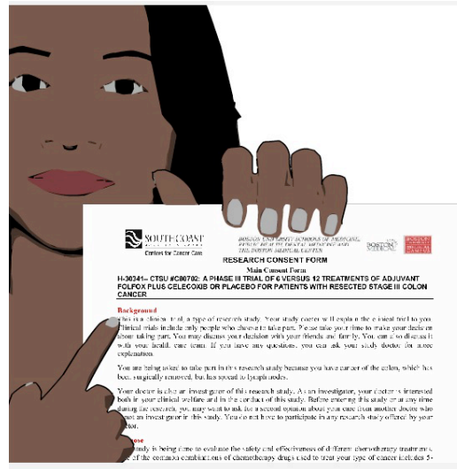
Fig. 1. Virtual Agent Explaining Informed Consent Document

with the agent vs. interfaces without it. In another study, students using the AutoTutor pedagogical agent in addition to their normal coursework outperformed both a control group (no additional intervention), and a group directed to re-read relevant material from their textbooks [13]