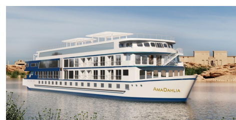
The stunning new AmaDahlia (rendering)