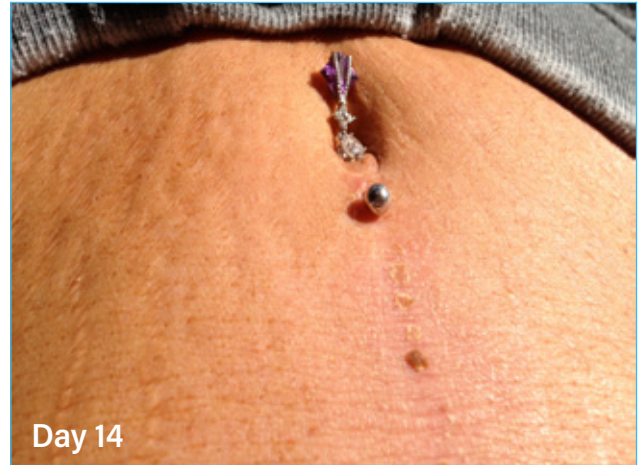
Vertical hyperpigmentation mark and horizontal stretch marks on 57 year old female. After 14 days, client was ecstatic to see the dark mark gone and an improvement in the appearance of the skin around the area.