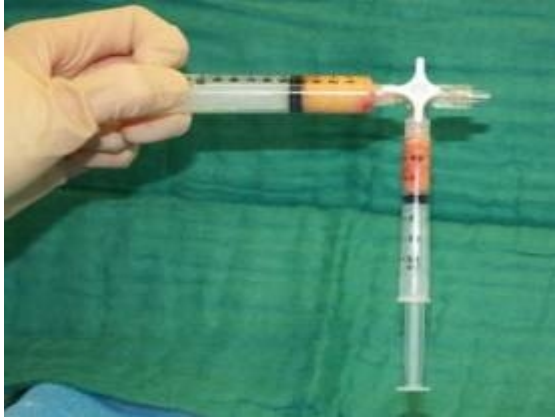
Fig. 3: Purified fat transfer from 10 ml Luer Lock® syringe to a 1 ml Luer Lock® syringe through a 3-ways connector.