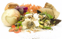
Organic, kitchen, yard and animal waste.

Unacceptable items - These items are NOT accepted with your recycling and require alternative handling.