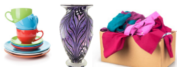
Textiles, housewares, windows, ceramics, and other reusable items.