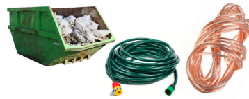
Scrap metal, wires and cables, home and construction waste.