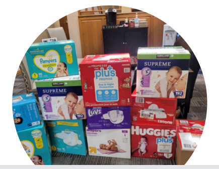
DIAPERS + WIPES

We're fortunate to have the community support that we do! In just the last few months, we've received diapers and wipes from Lakes LifeCare Center, books from Maxfield Elementary, and volunteer knitted hats and scarfs from The Yarnery!