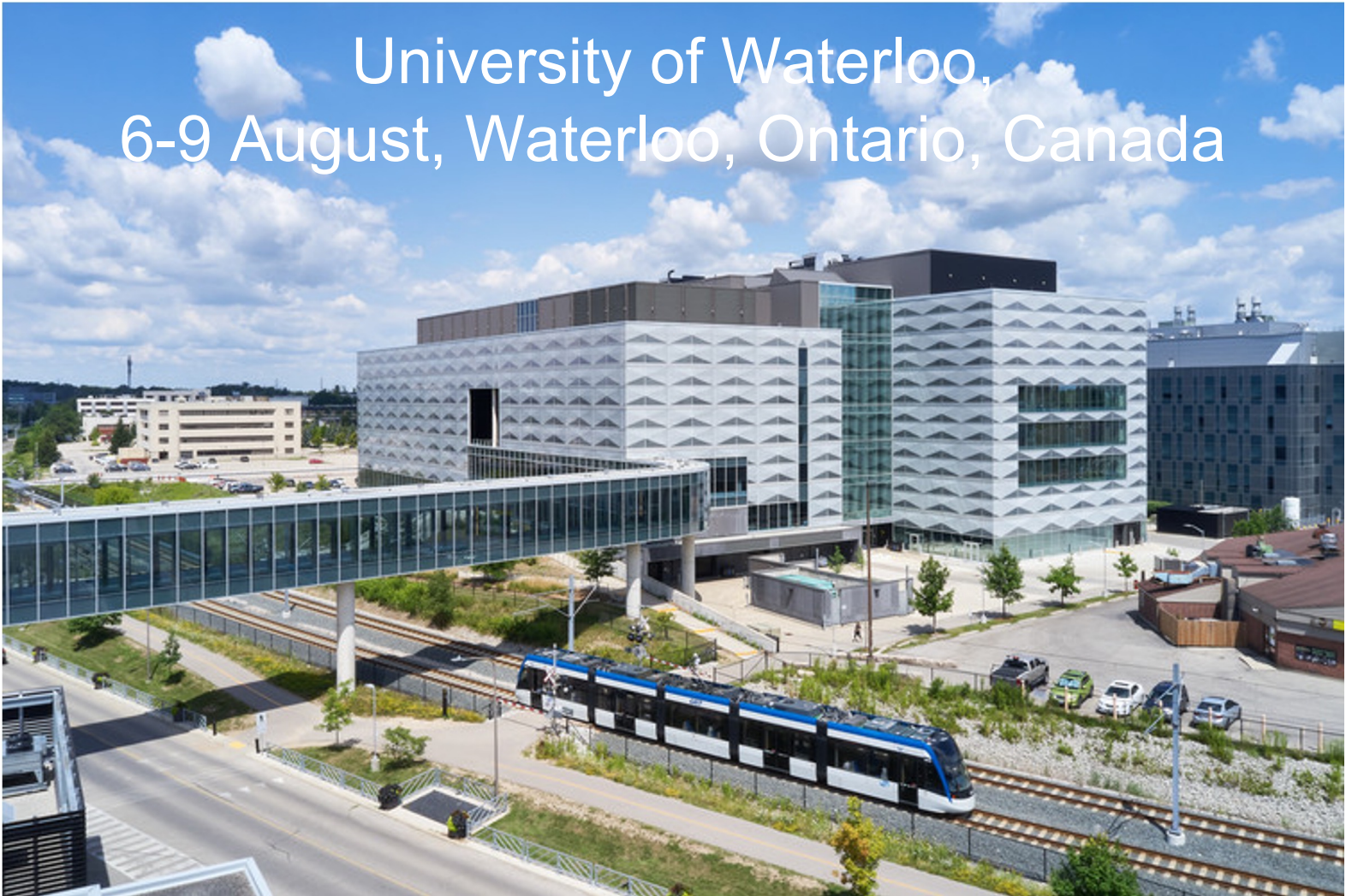
University of Waterloo E-7 Building showing the regions ION Express

University of Waterloo, 6-9 August, Waterloo, Ontario, Canada