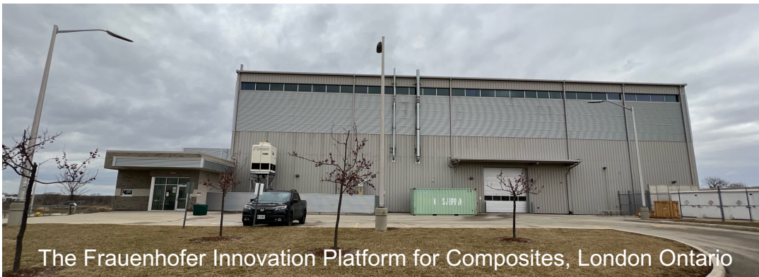
The Fraunhofer Innovation Platform for Composites, London Ontario

We highly recommend to all our conference participants to attend Industry day at the Fraunhofer Innovation Platform for Composites (FIPC) in London, Ontario, which are planned to bring interactive discussions among participants from industry and academia! A bus will take attendees from Waterloo to London on the 6 th of August. More information will be posted on http://www.cancom2024.ca and the CANCOM2024 Linked In page. We recommend you follow us on Linked In.