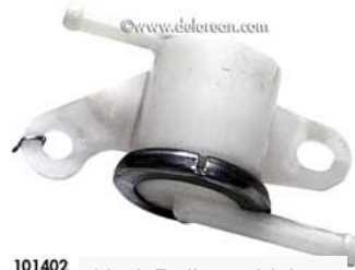
101402 1978 Rollover Valve

78' Dodge Truck Roll Over Valve $45 + shipping. Order Number- #78 Roll Over