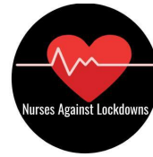
Canadian Front Line Nurses

Our brave front line nurses who formed Canadian Front Line Nurses , will be holding a rally in front of the College of Nurses of Ontario.