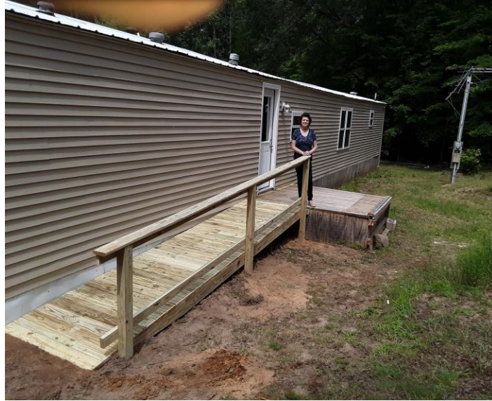
Whittemore Ramp July 14th