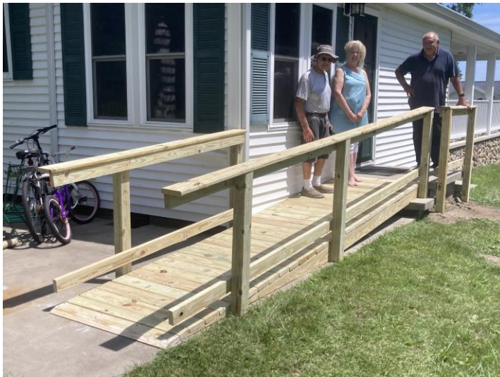
Harrisville Ramp – July 9th