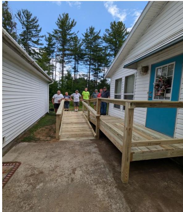
Tawas City Ramp – July 17 th Before and After