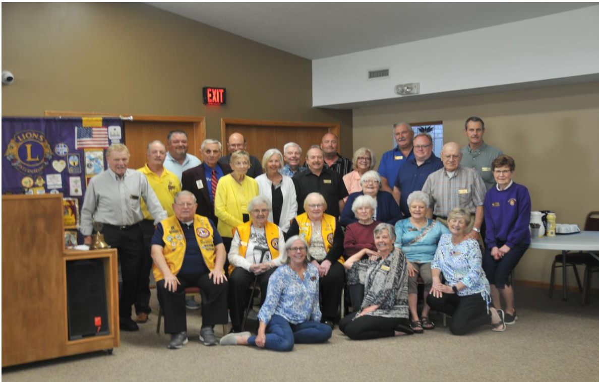
Oscoda Lions Club – We Serve