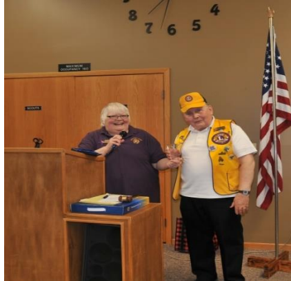
Lion Jim Doc Barr Fellowship