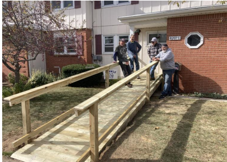
Villages of Oscoda