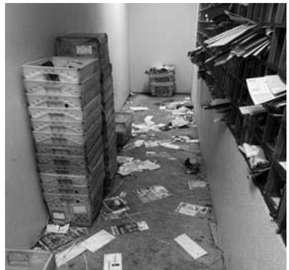
DON'T BE THIS GUY