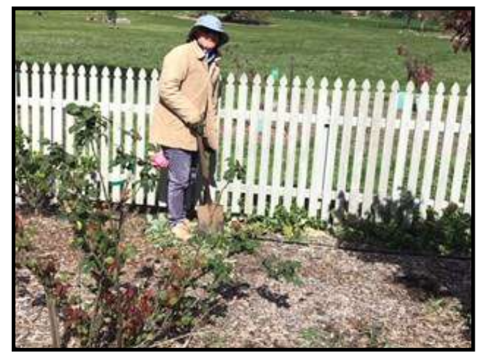
The plans are to water and plant the lawn where the grass is now and to get rid of the capeweed which is becoming a problem.

Also two dog signs are now placed in the garden regarding dogs who were not on leads and were running wild over the garden and knocking some of the trees about.