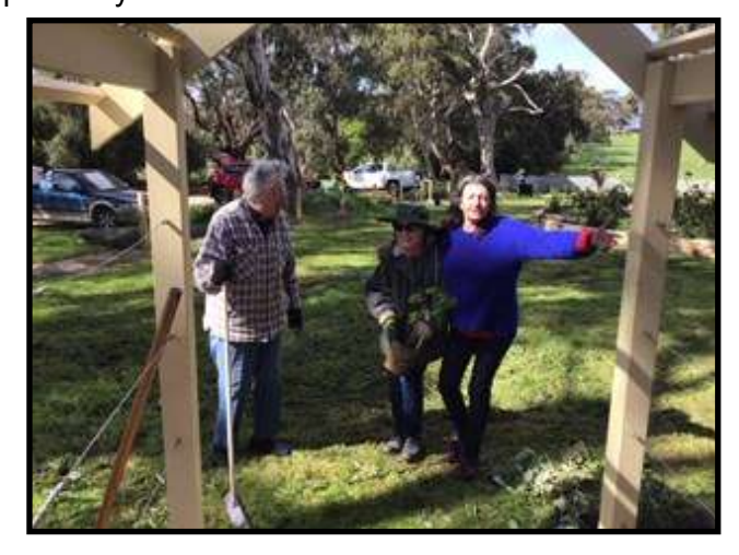
ON BEHALF OF THE ROTARY CLUB OF BLAKISTON WE WISH YOU ALL VERY MERRY CHRISTMAS AND A HAPPY NEW YEAR

Donations are always welcome to eradicate polio around the world. Keep an eye open for the ute as it passes your door.