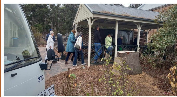
Passengers of the History Tour explore St James Anglican Church

Busloads of passengers were transported around the town, visiting significant historical locations and hearing stories about the formation of Littlehampton in the late 1840s.