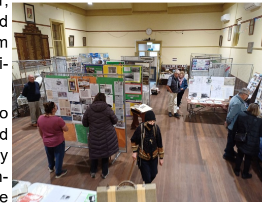
History boards were on display in the Hall for the week-

Local clubs, businesses, and organisations also got onboard to show off their history, including the Adelaide Hills Spinners and Weavers, Peace Memorial Hall, and the Littlehampton Community Association's board of all their projects and events in the town, including the old Littlehampton Markets, Chat & Play, Carols in the Glebe, and the Littlehampton Entrance Statement.