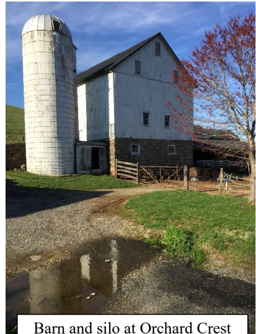
Barn and silo at Orchard Crest Farm in Purcellville, Virginia.