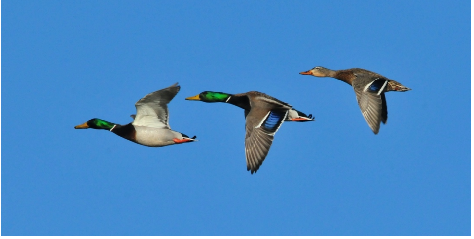
Mallard Ducks Flying