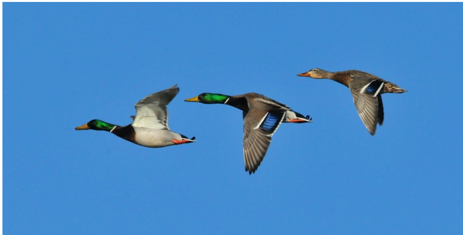
Mallard Ducks Flying