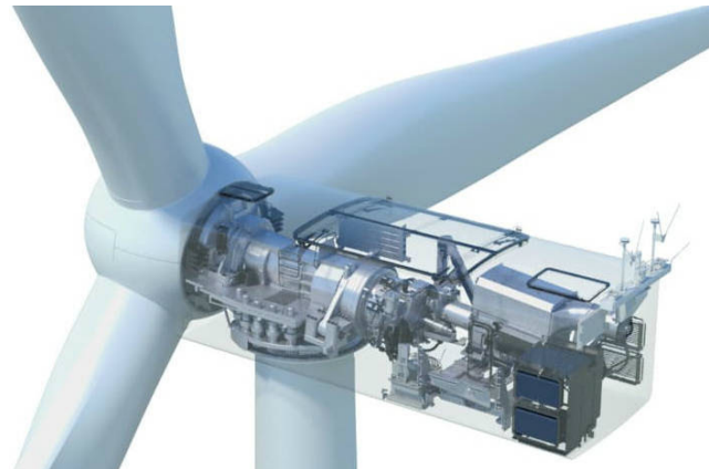
Inside of modern day wind turbine that produces electricity