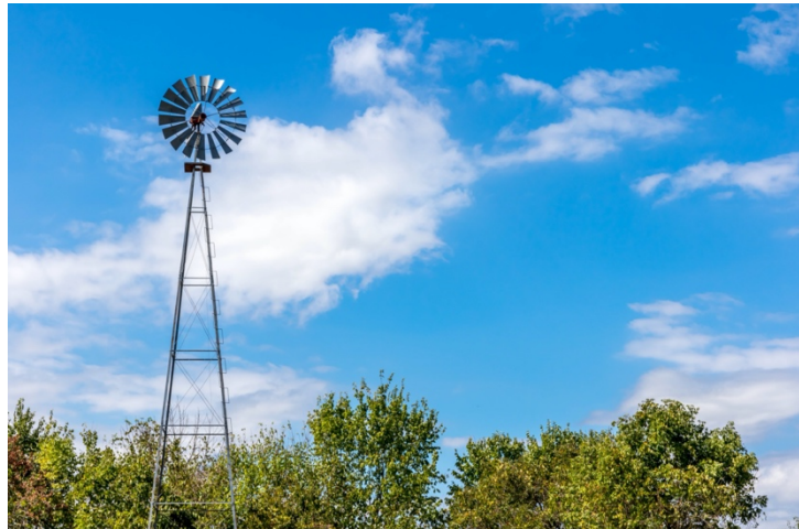
Outside of the Museum From the parking lot, walk to the left of the museum

The windmill inside the museum was originally part of the estate of Belmont Manor House, which was once home to Patrick Jay Hurley, former Secretary of War, under President Herbert Hoover. This site is the tallest point in eastern Loudoun County, Virginia with views of the surrounding hills and countryside and the approaches to and from the Town of Leesburg. This windmill was originally used to pump water for the farm that was once on the land. The land has been developed into homes and the farm is no longer in existence. The Belmont Manor House is now the club house for Belmont Country Club. Once the windmill was donated to the Loudoun Heritage Farm Museum, it underwent a three-month restoration process.