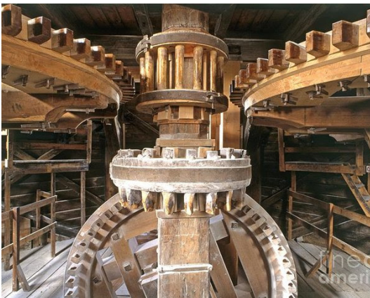
Gears inside windmill used to grind grains

A windmill is a working engine that turns the wind into energy. When the wind blows it starts spinning the large sails or blades attached to the top. Once these blades start spinning the energy is then sent down a spinning shaft in the base of the windmill which then turns the gears of the motor.