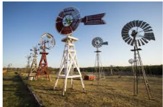
Examples of Historic and Modern Windmills