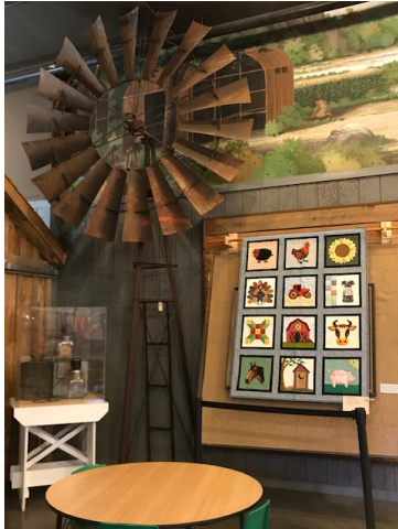
Inside the Museum

The Loudoun Heritage Farm Museum has two different windmills displayed at the museum. One is located outside that you can walk to.