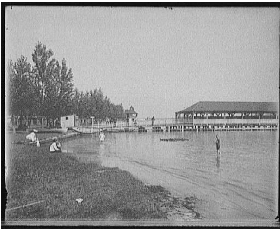
An early photo of Tashmoo Park around 1905. The dock is in the background.

HARSENS ISLAND ST. CLAIR FLATS HISTORICAL SOCIETY PO BOX 44 HARSENS ISLAND MI 48028