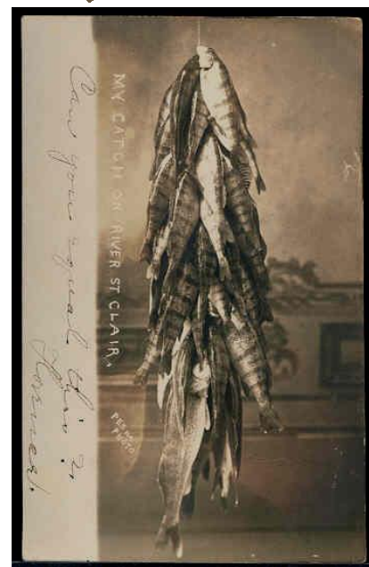
Pesha Photo – "My Catch on River St Clair" listed in an ebay store for $29.99.