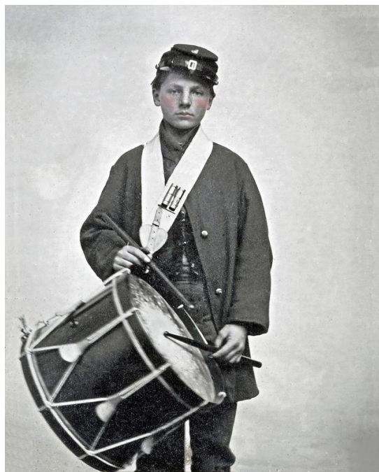
Drummer boys and buglers were often the target of sharpshooters as they signaled troop movements.

HARSENS ISLAND / ST. CLAIR FLATS HISTORICAL SOCIETY