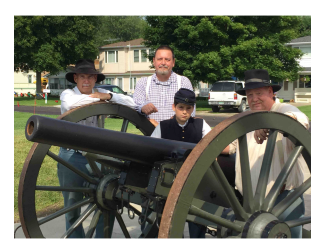
Civil War Re-enactors Interpretive Program