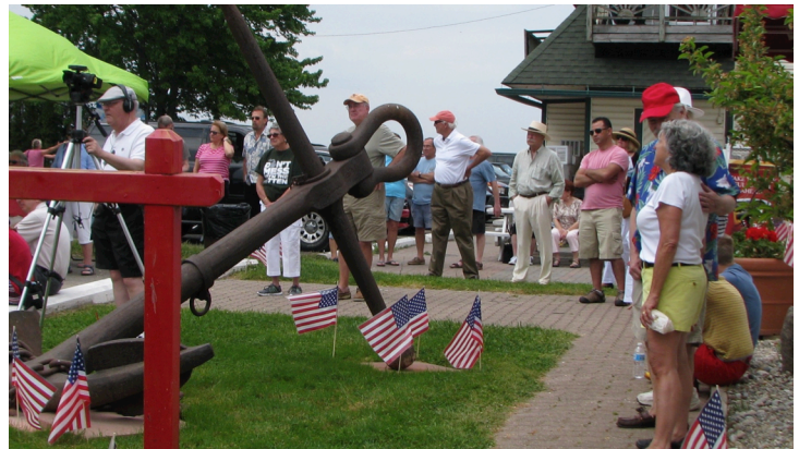
Crowd gathered for Ownership Celebration