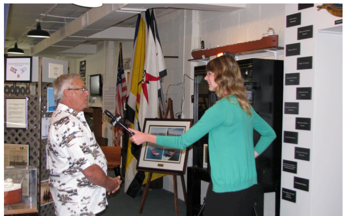
Being Interviewed by EBW TV