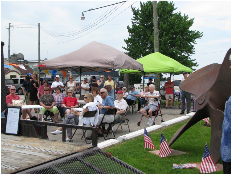
They came to CELEBRATE

HARSENS ISLAND / ST. CLAIR FLATS HISTORICAL SOCIETY