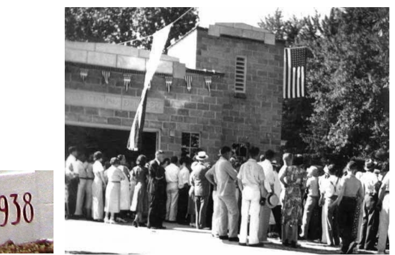
Original Dedication c. 1938

Museum Grand Opening Day Celebration – Memorial Day Weekend 2011