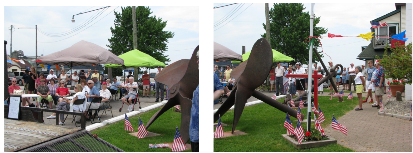
Museum Ownership Celebration – Memorial Day Weekend 2016