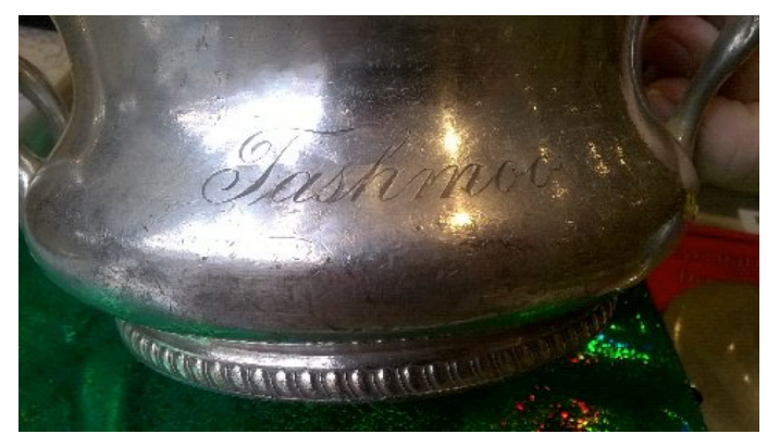
Close-up of Artifact

A glass coffee cup souvenir of Tashmoo Park now also graces' the shelves of the Tashmoo Room. The collection continues to grow.