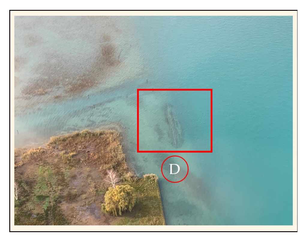
One of four ships that were scuttled during WWI near Russell Island (information shared word of mouth a couple of the wrecks can be seen on Google Maps Satellite)