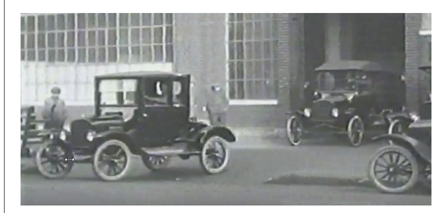
Ford automobiles coming off the assembly line.

After the prohibition law was passed productivity in the workplace went up, crime went down and accidents and absenteeism at work went down. As a result, prosperity was on the rise, new homes were being built and people could afford to have 2 cars in the driveway. It was a boom for the automotive industry.