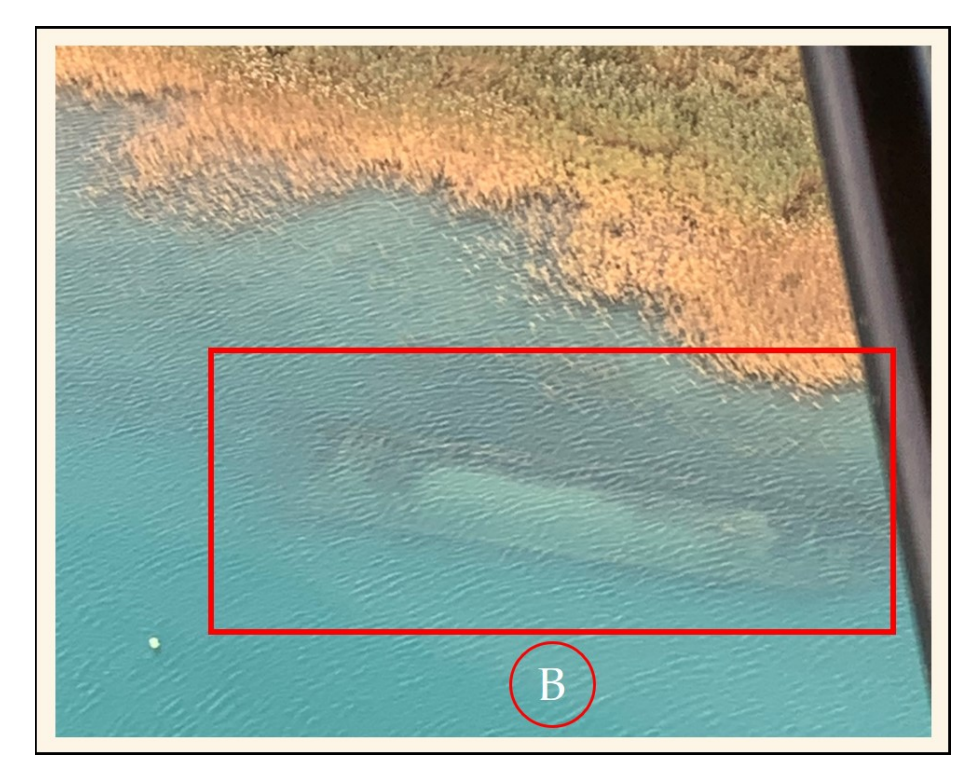
Shipwreck across the river from Bruckner Island (can be seen on Google Maps Satellite) continued on page 8...