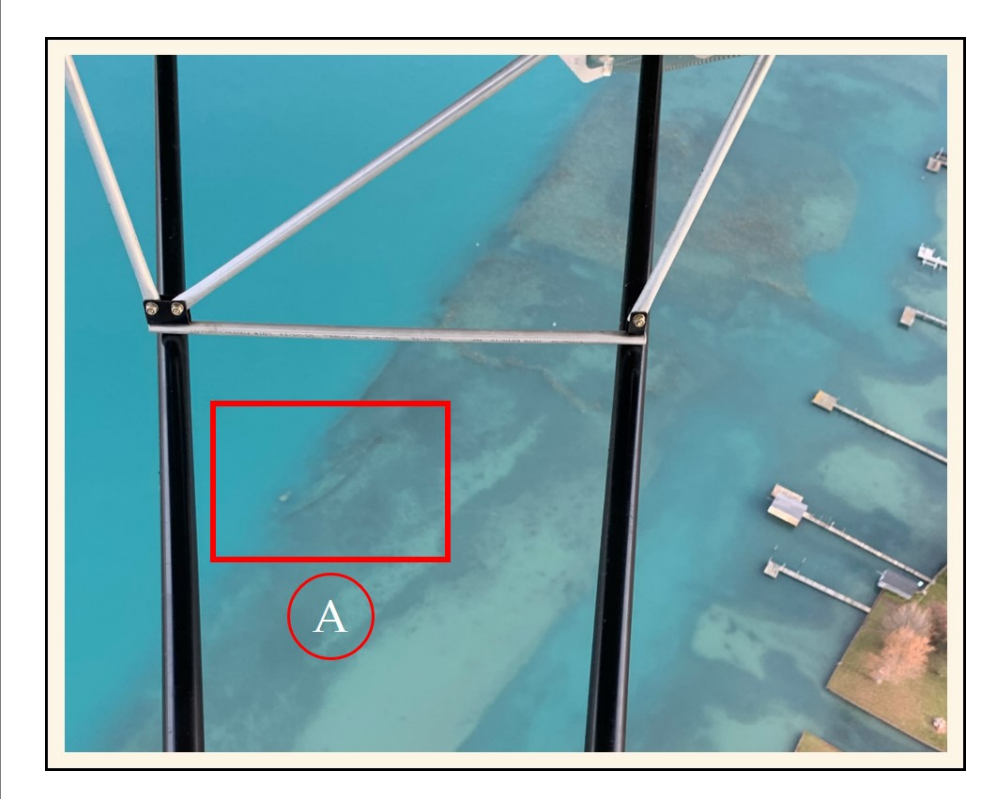
Shipwreck down river from Browns (can be seen on Google Maps Satellite)