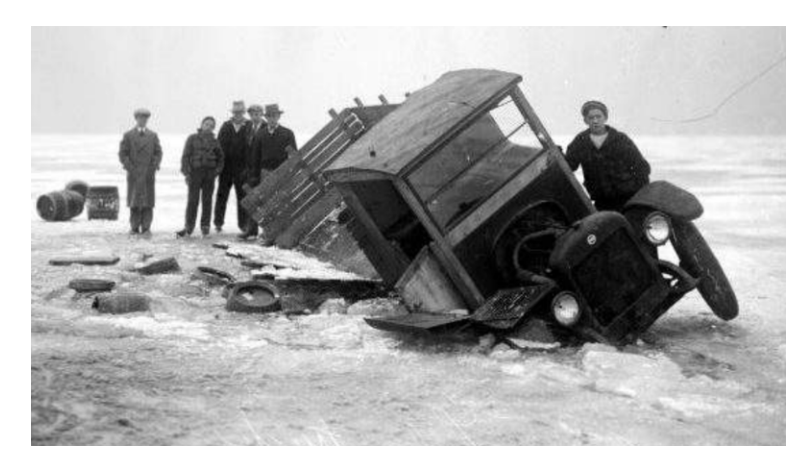
A beer laden truck breaks through the ice on Lake St. Clair in route to Detroit from Ontario. Circa 1920s

Early in the prohibition there were three major bootlegging operations in Port Huron. But downriver the local freelancing bootleggers thrived. Prohibition turned family homes into speak-easies (blind pigs) and neighbors into bootleggers. Just average people trying to make a dollar during lean times. Some speak-easies offered alcohol, food, and dancing and others offered alcohol and a game of cards.