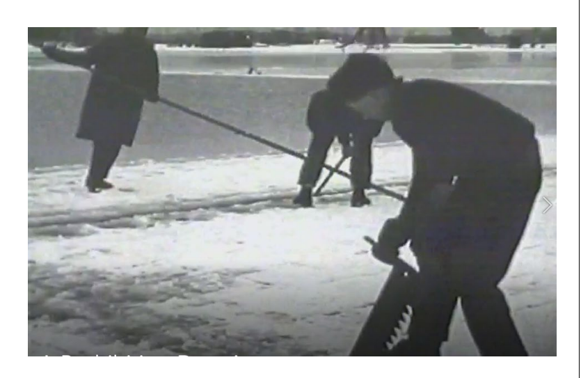
Cutting ice blocks from the frozen river for $1 a day.