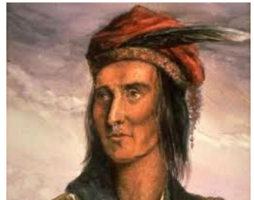
Tecumseh