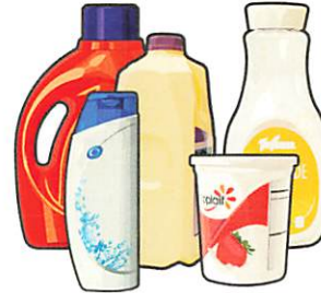
Plastic Bottles, Jars and Jugs (empty and dry)