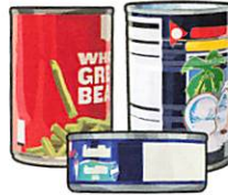
Aluminum Cans (empty and dry)