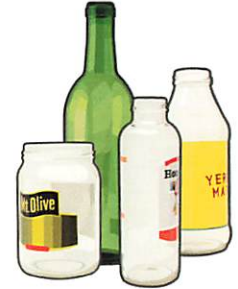
Glass Bottles and Jars (empty and dry)