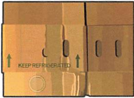
Cardboard (empty and dry)