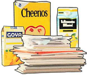
Paper and Cartons (all colors and types)