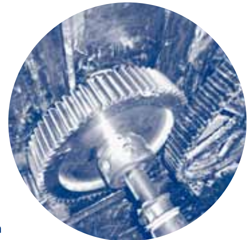
New gearing on the Lime Transfer Elevator, which is part of the corrosion control process

If you remain concerned about lead in your water, visit www.saginaw-mi.com/lead or contact your community (see last page of this report).