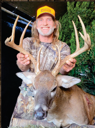
HAIRDO STRAWDERMAN - 14TH SLANESVILLE, WV SCORE 124 1/8 A-1