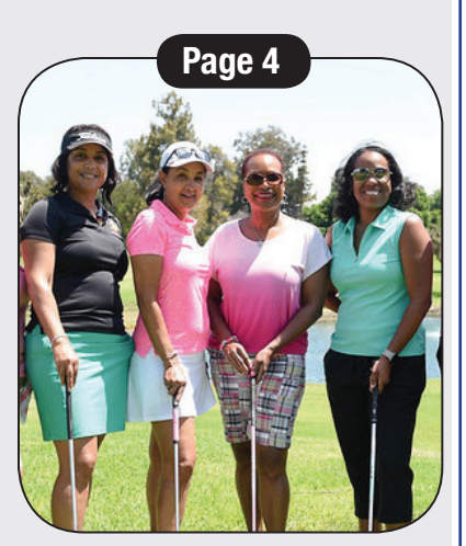
Alpha Kappa Alpha tees off for scholarships