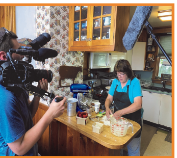
Video series about Dairy Sustainability

Animal wellbeing, sustainability and flavor are your priorities when purchasing dairy foods.