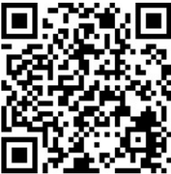
Use this QR code for PayPal

We are Grace Baptist Church - a ministering people of God, reaching beyond our walls to the needs of our local and global community. We are an intergenerational faith community called and committed to the life of love and servant-hood through the experience of celebrative worship, the development of each person’s gifts and the work for peace and justice. In our diversity we find strength and a way to understand the inclusiveness of God. We recognize each individual as a child of God. We welcome and affirm ALL people, who and where you are, to join in our common mission through participation and leadership in this community of faith. We are affiliated with the Alliance of Baptists, the Baptist Peace Fellowship of North America and the Association of Welcoming and Affirming Baptists.