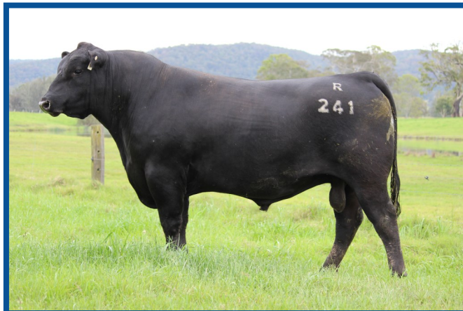
KAROO P195 JUNIOR R241

Excitement is an understatement around here, with one of our lead donor cows freezing 45 embryo's for her first flush! New AI sires include Lawsons Rocky R4010 and Dunoon Recharge R102. Both of these bulls will mix into our herd well and join the powerful list of sires already mentioned above.