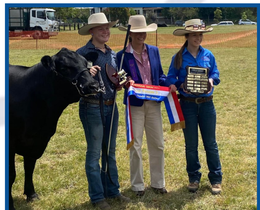
GRAND CHAMPION PARADER