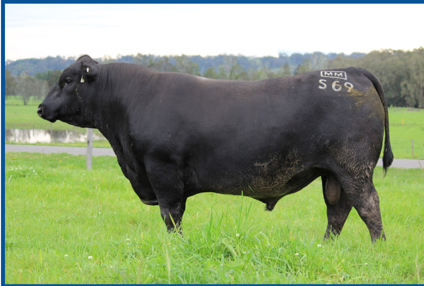
MILLAH MURRAH STORMTROOPER S69

With 2022 calving all done and dusted, we have some sensational progeny bouncing around our paddocks. We are loving our AI calves, with sires Texas Iceman R725, Sterling Pacific 904 and Exar Pillar being some of the standouts with type and consistency.