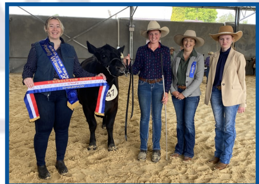
BOAMBEE KERRY S2