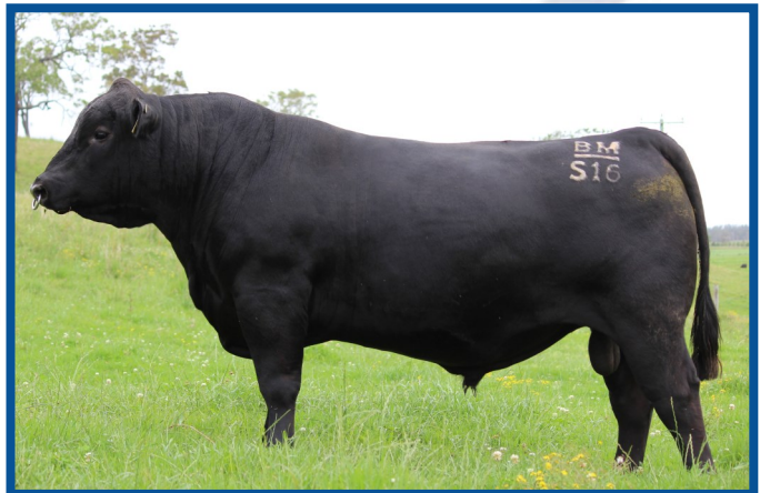
BOAMBEE SURETHING S16