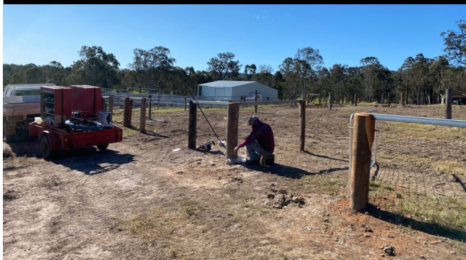
It's not all about playing with cattle around here. There is some hard work too!