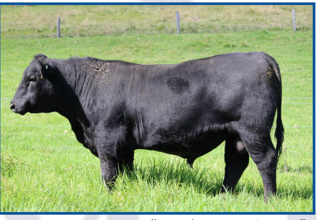
Musgrave Avenger son "Boambee Sensation S13"

The excitement doesn't finish with our autumn calving females. Heading into late winter/ spring, we will see our next crop of calves start hitting the ground. The results from our genetic choices will be some of the first progeny in Australia, from sires such as the 2021 Texas Angus top selling bull. Texas Iceman R725 sold to Mackas Pastoral for a record breaking $225,000. Iceman R725 is a bull that we happened to see in the flesh and could not fault.