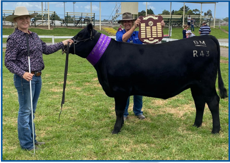
Supreme Exhibit Maitland Show 2022 "Boambee Ela R43"

It is great for the shows to be back, bigger and better after the challenging years faced with COVID-19.