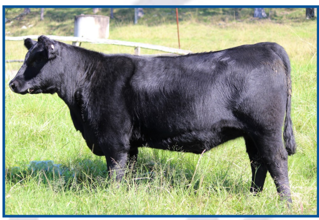
Harvestor N169 daughter "Boambee Kerry S25"

Also our walking sires Sugarloaf Harvestor N169 and Knowla Packer P141, progeny are hard to miss with the consistency and type that they bring to the females they are joined with.