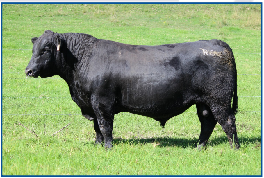
Walking Sire "Premier Stunner R84"