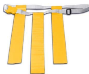
Example B (Illegal)