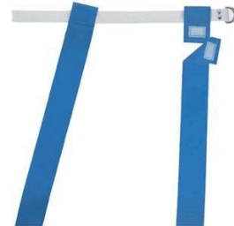
Example C (Illegal)