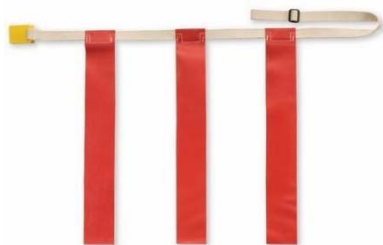
Example A (Legal)